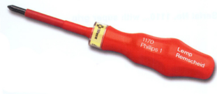
Super grip Code 1183---