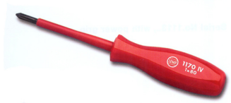
Power grip Code 1133---