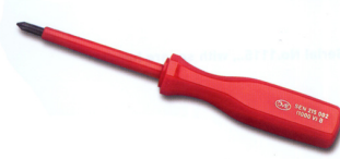
Square grip Code 1135---