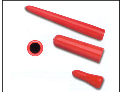
② Conical Opening type