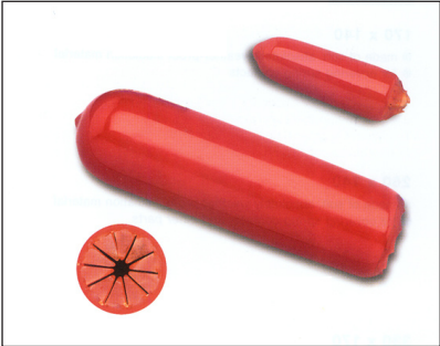
① Gripping Opening type